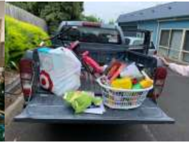
Taking home "the goodies"!

We have been able to provide around 200 generous hampers as well as toys and other gifts this year to both families at the Andrews Centre and the Monday Meals team thanks largely to The Andrews Foundation and the supply of some beautifully presented and heavily packed hampers from the parishioners at St Paul Apostle Catholic church and the "Sisterhood" group as well as toys and food from Endeavour Hills library, Endeavour Uniting church and Gleneagles Secondary College. It was wonderful to see the joy on the faces of many who had thought Christmas was going to be very bleak for themselves and their children. One mother of seven children who received a generous hamper and supply of toys just stood in the middle of the Centre waiting area and cried. She could not believe what she was receiving and was just overwhelmed. All year she has struggled to survive without her husband who, because of Covid19 was trapped overseas following a family member funeral. I was just really moved to see a refugee lady battling bowel cancer who, in response to the kindness shown to her, poured out something of her story and how much this gift meant to her. She touched the heart of an Australian mother standing nearby, who happened to be waiting for a hamper! She just spontaneously reached out to this woman with great warmth and compassion.