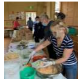
Christmas hampers at the Monday meals Christmas lunch Preparing the meals

Unfortunately, due to Covid19, we had to suspend the sit-down Thursday meals at the Andrews Centre. Nevertheless these meals continue to be made and many have benefited from our supply of packaged frozen meals which are distributed every week day to many homeless and singles who would struggle to prepare nutritious meals for