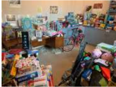
Christmas hampers and toys 2020